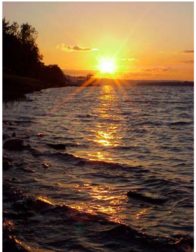
Sunset on the Ohio (Ken Cooke).