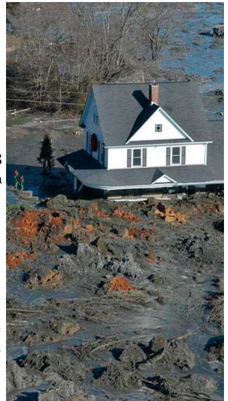
Coal Slurry reaches first floor of house in its path.

was not finalized. Local residents said that the spill was not a unique occurrence; the 1960s-era pond had been observed leaking, and being repaired, nearly every year since 2001. A TVA news release confirmed that there had been two prior cases of seepage, in 2003 and 2006.