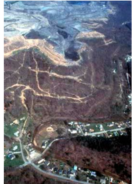
Large mountaintop removal mines like the one pictured above loom over small communities, predisposing them to devastating floods.

The EPA said in a statement that it would be actively involved in the review of the long list of permits awaiting approval by the Corps, a signal that the agency under the Obama administration will exercise its oversight. The EPA has the authority to review and veto any permit issued by the Corps under the Clean Water Act, but under the Bush administration it did that rarely. Mountaintop mines in West Virginia, Virginia, Kentucky and Tennessee produce nearly 130 million tons of coal annually — about 14 percent of the nation's power-producing coal — which in turn generates electricity for 24.7 million U.S. customers, according to