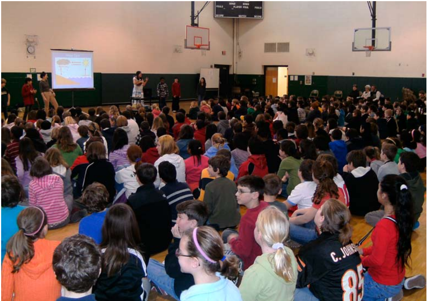
5th grade assembly at Edwin H. Greene Intermediate School introducing Rain Garden program.

Ohio River Foundation – the leading provider of Ohio River watershed education has begun its highly anticipated School Rain Garden program. Four Cincinnati schools have been selected as the first participants in Ohio River Foundation’s School Rain Garden program. Students will learn about, design, and install a rain garden on school property. They will also receive hands-on watershed curriculum instruction from Ohio River Foundation.