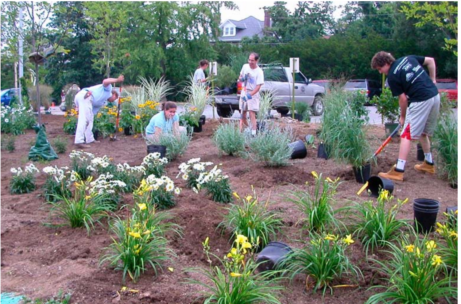
ORF and Cincinnati Zoo staff at work installing 4000 sq. ft. rain garden.